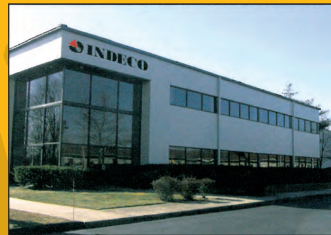
Indeco North America Milford, CT USA

Today, Indeco operates four manufacturing facilities for the production of their breakers, pulverizers and multi-processors. In the world market, Indeco continues to penetrate new markets and to grow within its existing marketing areas.